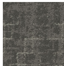
Slate 84518 LRV 13.2