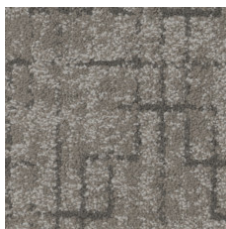
Granite 84105 LRV 20.6