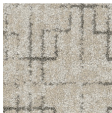
Marble 84100 LRV 42.7