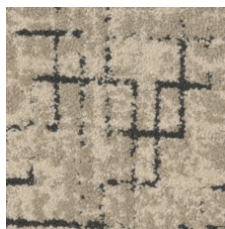
Pebble 84111 LRV 39