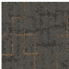
Flint 84761 LRV 8.1