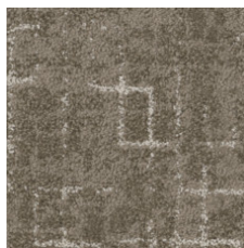
Clay 84506 LRV 16.6